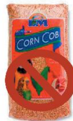
Corn Cob Causes Lethal Blockages