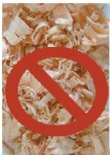
Pine/Cedar Shavings Causes Liver & Respiratory Damage