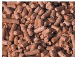
Wood Stove Fuel Pellets