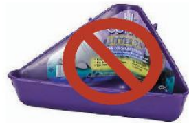
Corner Litterboxes Too Small, Even for Small Rabbits