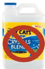
Silica-Gel Crystals Toxic if Eaten