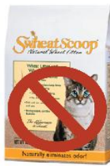
S'wheat Causes Problems if Eaten