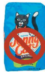
Clumping or Clay Litters Causes Lethal Blockages